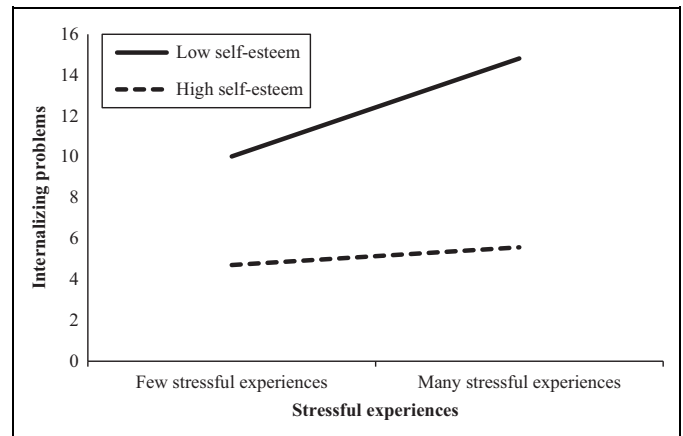
Figure 2. The interaction effect has been illustrated for internalizing problems in the graph for a group with few stressful experiences ( M - SD ) and for a group with many stressful experiences ( M + SD ), controlled for sex and socioeconomic status.

esteem and the interaction term were negatively linked to INT, suggesting that adolescents who scored lower on self-esteem also reported more stressful experiences. In addition, a higher score on self-esteem weakened the relation between stressful experiences and INT problems. The interaction is illustrated in Figure 2, in which we see the relation between stressful experiences and psychological problems for adolescents with low self-esteem ( M - SD ) and adolescents with high self-esteem ( M + SD ). Note that these groups were created solely for the purpose of illustration and were not used for the analyses. Moreover, for reasons of clarity, the interaction effect is illustrated for the nonlatent scores.